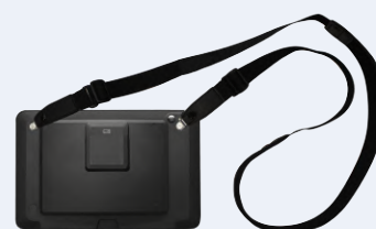
P-2HS02 Shoulder Strap