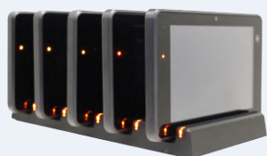
P-2CH01 5 Bays Tablet Charging Station