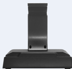
P-2DK02 I/O Docking Station