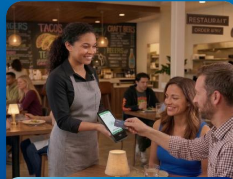
Mobile Payment & Transactions