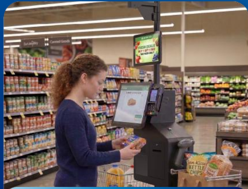
Engagement & Self-Service